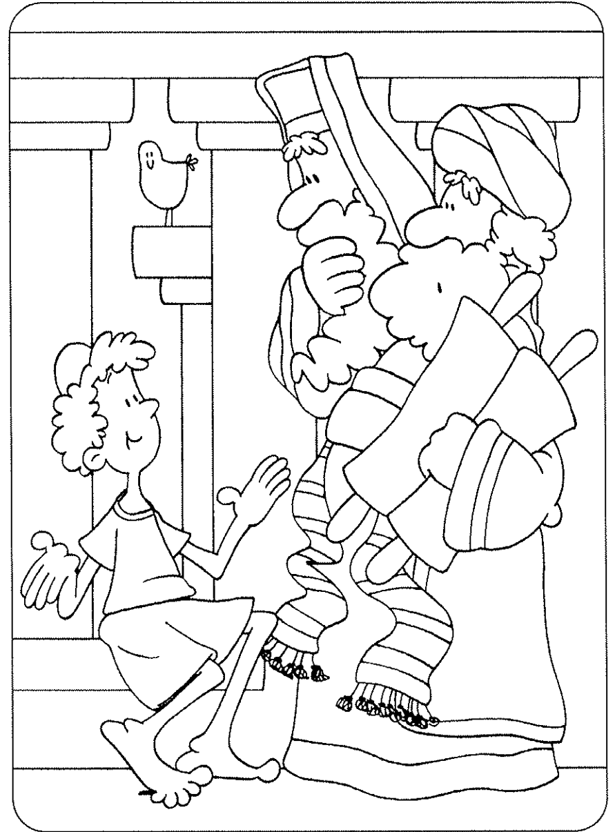
They found Him in the temple, sitting among the teachers. Luke 2:46

Permission to copy granted for one-time use on January 3, 2021, only.